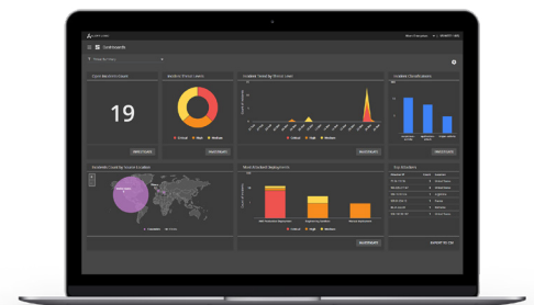
Alert Logic Console Dashboard

Our platform delivers real-time reporting, giving you access to information on risk, vulnerabilities, remediation activities, configuration exposures, and compliance status. With this intelligence, you can focus on a prioritized order of threats that need further triage, drill down into threats to act on or mitigate exposure, and provide intuitive risk visualization.